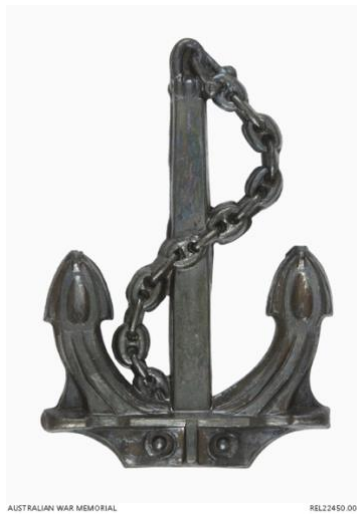
The Badge of the Royal Australian Navy Bridging Train

One naval symbol, the fouled anchor, is used by many navies around the world. The symbol was used for the first time in 1601 by the Earl of Nottingham